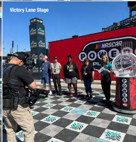
Victory Lane Stage