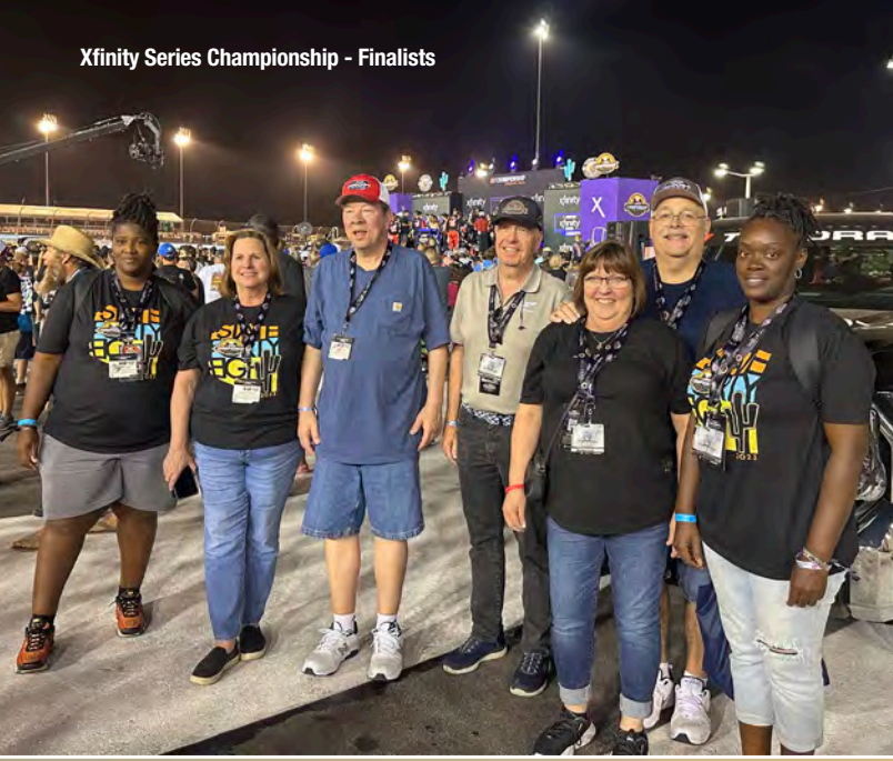
Xfinity Series Championship - Finalists