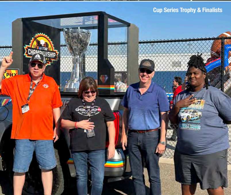
Cup Series Trophy & Finalists