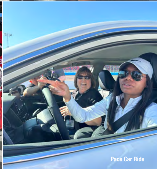
Pace Car Ride