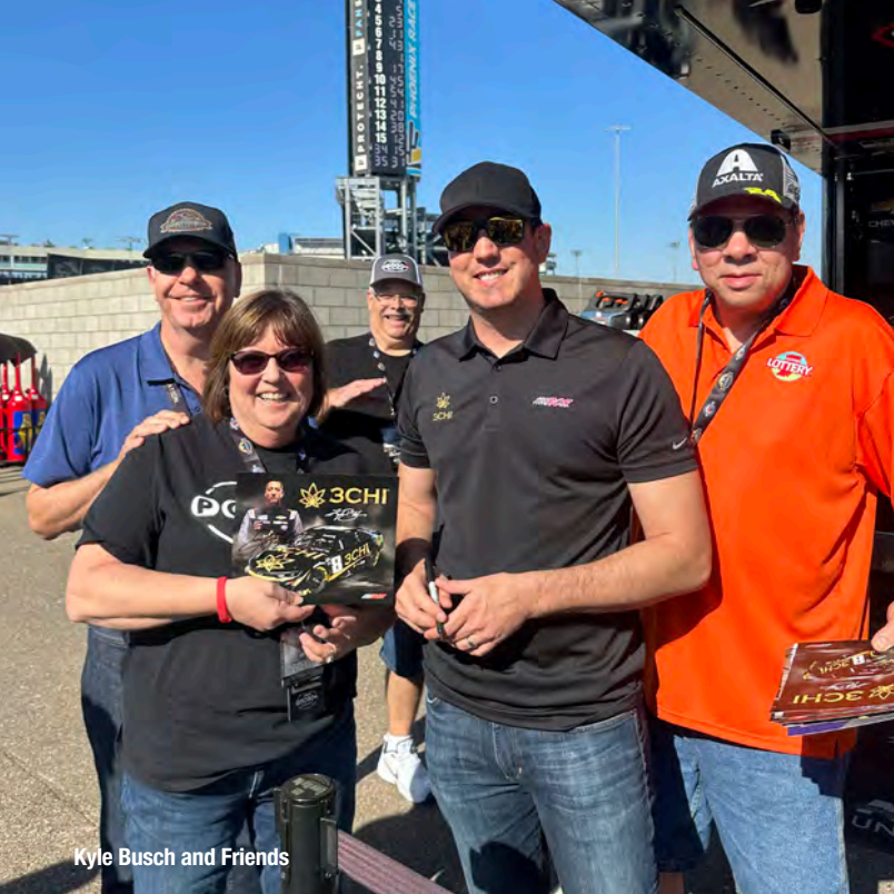
Kyle Busch and Friends