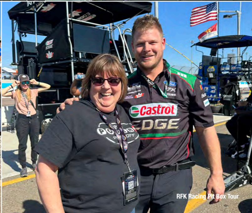
RFK Racing Pit Box Tour