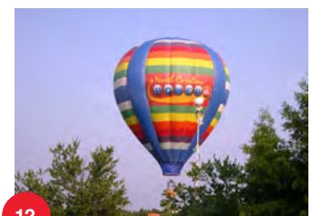
12. The North Carolina Education Lottery launches a hot air balloon over the Raleigh claim center to commemorate the start of Powerball sales in the state on May 30, 2006.