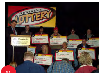
11. A group of eight coworkers at the ConAgra Foods ham and corned beef plant in Lincoln, Nebraska won a record $365 million jackpot in the Feb. 18, 2006 Powerball drawing.