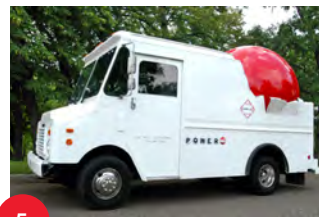
5. "Don't belittle Powerball ... it's always big!" A Minnesota Lottery campaign launched in 2002 reminded players that the jackpot is always big.