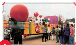
3. Louisiana joined Powerball in 1995. To mark the occasion, the Lottery sponsored the longest parade called "As Big As It Gets." The Powerball float visited 55 cities and towns and travelled over 1,500 miles making it the world's longest parade.