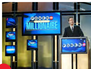
4. Powerball Instant Millionaire was one of two Powerball-based game shows that featured lottery players in the early 2000's.