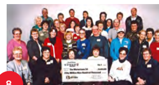
8. A group of co-workers became the South Dakota Lottery's first Powerball jackpot winners in February 2003. The Watertown 34 split the $101.8 million jackpot with an Indiana player, taking the $27.4 million cash option for their half of the jackpot.