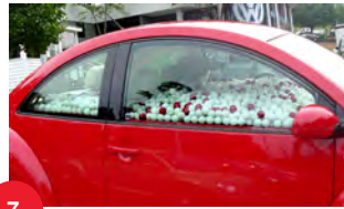
7. South Carolina launched Powerball in 2002 with a "PowerBug" contest. A red VW bug filled with red and white ping pong balls toured the state. The person who guessed closest to the correct number of balls won the car. There were 17,166 ping pong balls inside, the winner missed by only six balls.