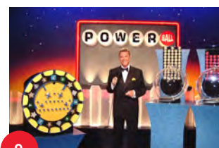
9. Long-time draw show host Mike Pace on the set of the Powerball drawing in 2005. At the time, the Power Play multiplier was selected by a wheel during the broadcast.