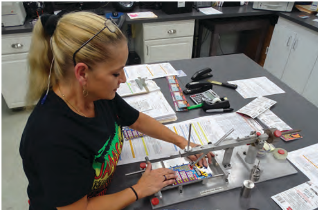
Scenes from IGT's award-winning North American printing facility in Lakeland, Florida. A range of environmentally friendly practices at this facility allow customers to participate in a sustainably minded

Renewing the facility and significantly reducing pollutants has made the plant a safer place to work, with positive impacts on both the environment and employee well-being.